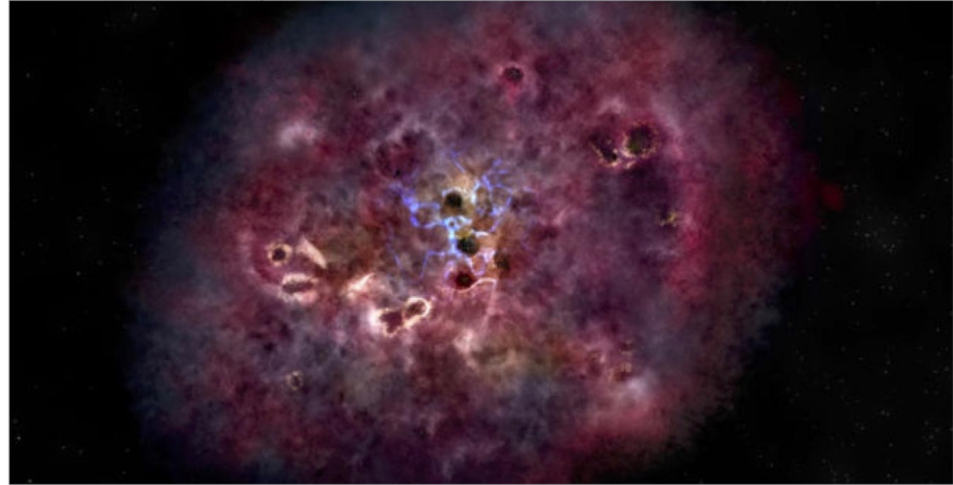
An artist's impression of the massive star-forming galaxy XMM-2599.

A team of astronomers based in California has found an ancient monster galaxy, which appears to have spontaneously shut down its star-formation over 12 billion years ago.